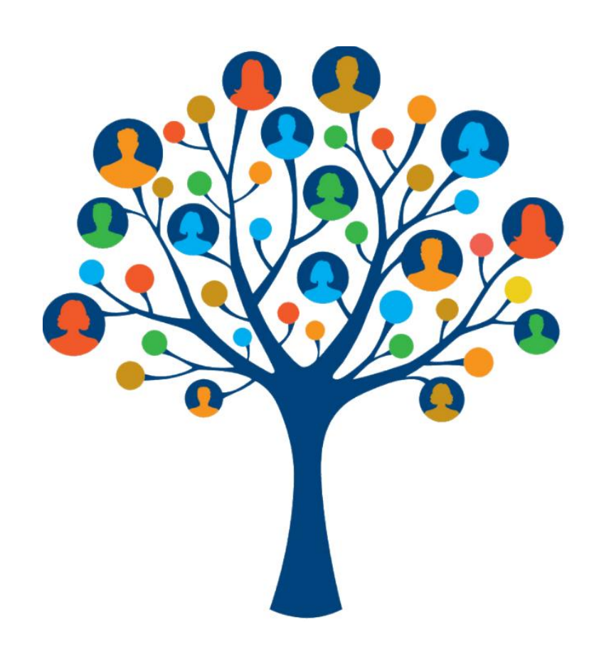
2020, PM Community of Learning