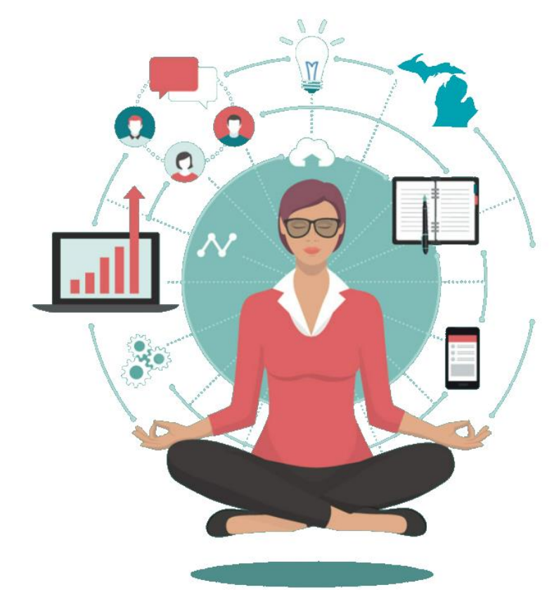
2012, Established a Statewide PM Support Specialist